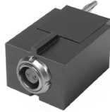
Lemo (2-pin) Model 9712L