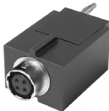
Hirose (4-pin) Model 9712H