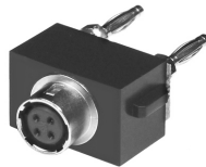
Hirose (4-pin) Model 9709H