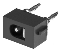
2.1mm (PP90) Model 9709P