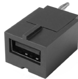
USB Model 9712U