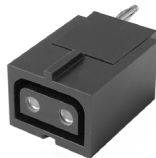
D-Tap Model 9712D