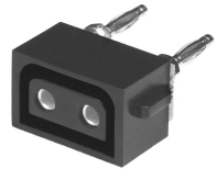
D-Tap Model 9709D