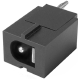
2.1mm (PP90) Model 9712P