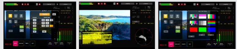
[UHD Cross Converter]