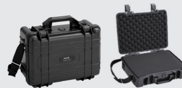
Hard Case (Basic Included)