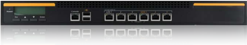
Wireless Bridge VPN Router Front Panel Configuration (BPL-380)

In your facility, the BPL-380 router aggregates up to 20 cellular uplinks. This means that you can equip all of the vehicles in your fleet with ProHD Bridge systems, and point them all to a single IP address in your facility. Combined with the BR-800 ProHD Broadcaster and BR-DE800 ProHD Decoder you'll have the most convenient, affordable and reliable wide-deployment mobile back haul system available!