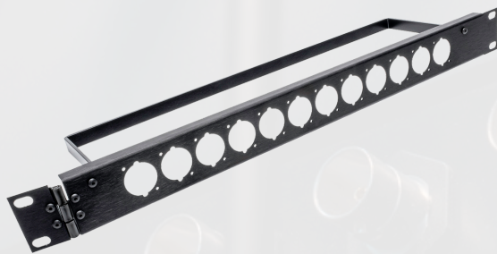
1RU, 12 Port Dimensions: 19in (482.6mm) x 1.75in (44.45mm)